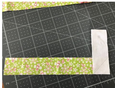
How to line up O and Y