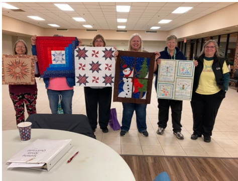
Round Robin Group 1

Below are pictures of most of the workshop participants. Some examples that Ann brought of the first border design are on the next page.