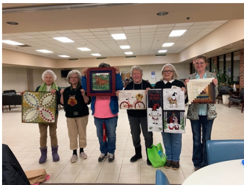
Round Robin Group 2