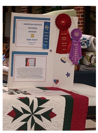
June Birthdays and Show & Tell