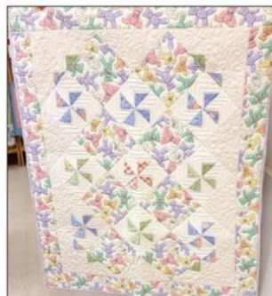
Spinning Spools Quilt Guild Donates Gifts Made With Love

By News Staff on Thursday, January 18, 2024