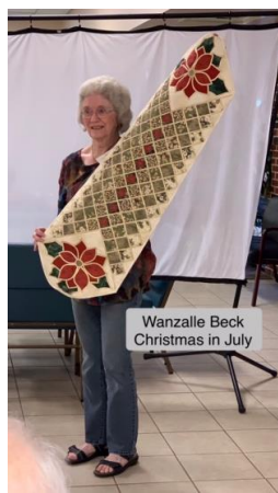
Wanzalle Beck Christmas in July