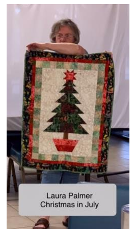
Laura Palmer Christmas in July