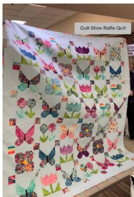
Quilt Show Raffle Quilt

Our raffle quilt for the Quilt Show – We’ll have better pictures soon